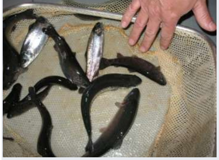
What can I say, but.....Old Boys Rule !!

Then next week we finish off our spring workload by stocking out 65,000 of the finest 8 inch fingerling steelhead smolt into the Saugeen way upstream 50 miles again for perfect imprinting at Walkerton